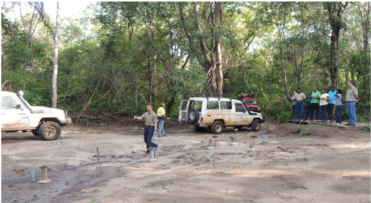
Photo 4. In Situ Leaching wells at MRP uranium mine test site.