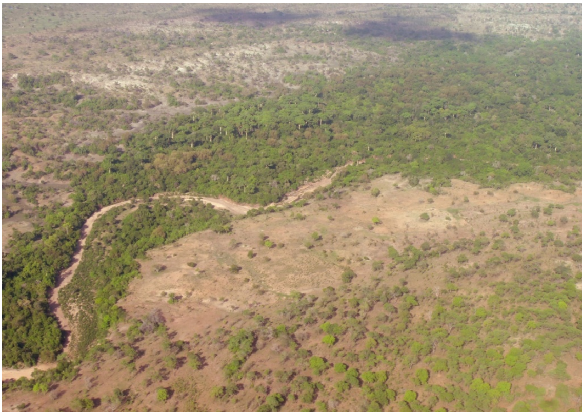
Photo 9. Diverse Miombo woodland and grassland vegetation types in Selous Game Reserve.