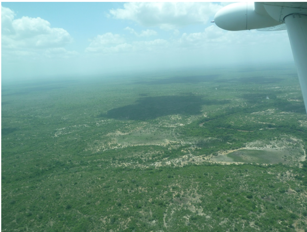
Photo 2. Area expected to be flooded by Kidunda Dam.