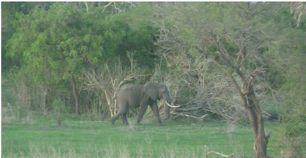
Photo 6. The only elephant observed by the mission in the Selous Game Reserve.