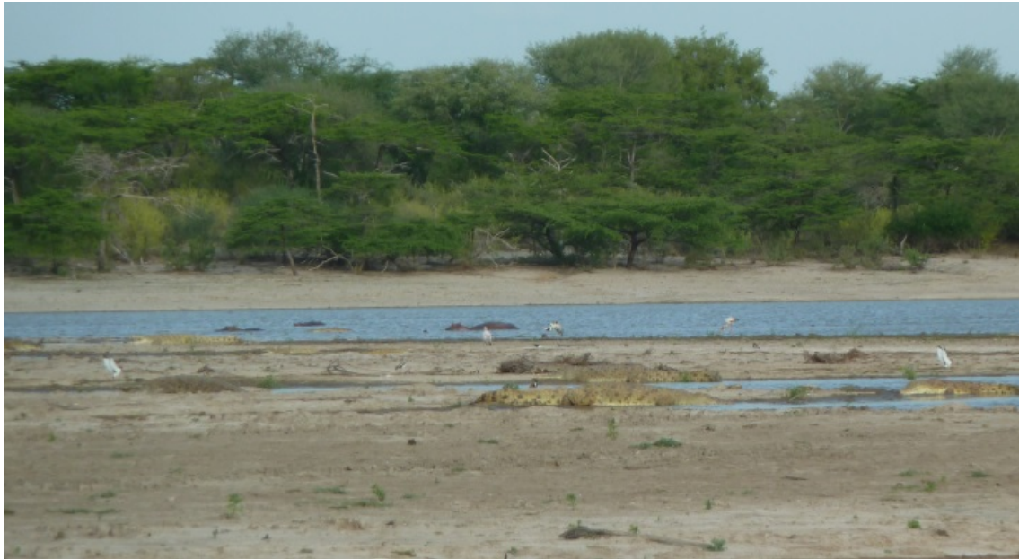
Photo 8. Hippopotamuses and crocodiles in Selous Game Reserve.