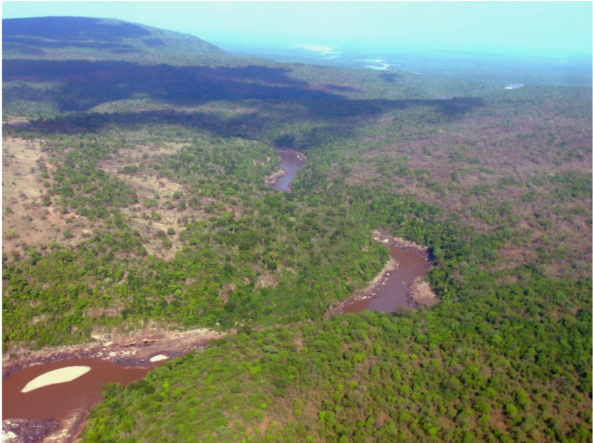
Photo 3. Proposed site for the Stiegler's Gorge Hydropower Dam.