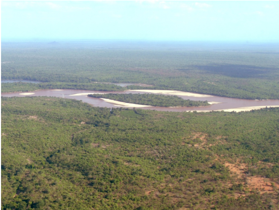
Photo 10. Rufiji River in Selous Game Reserve.