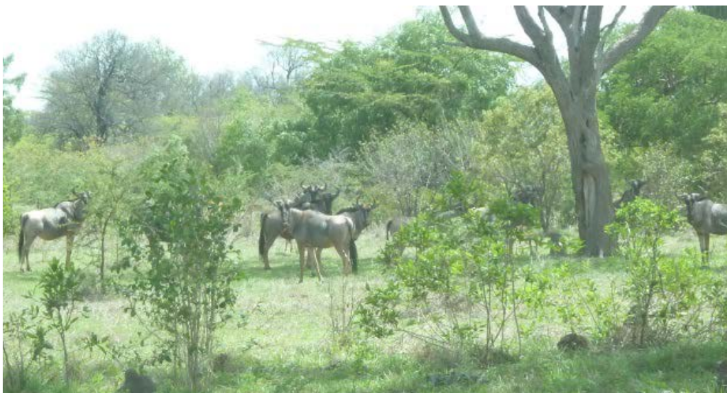
Photo 7. Nyassa wildebeest in Selous Game Reserve.