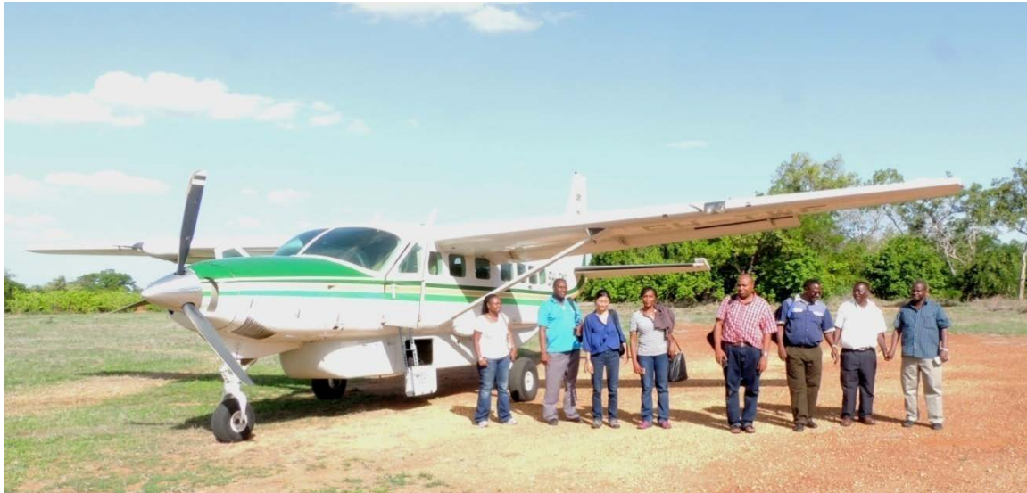
Photo 5. Mission with accompanying officials including the pilot of the light aircraft in Selous Game Reserve.